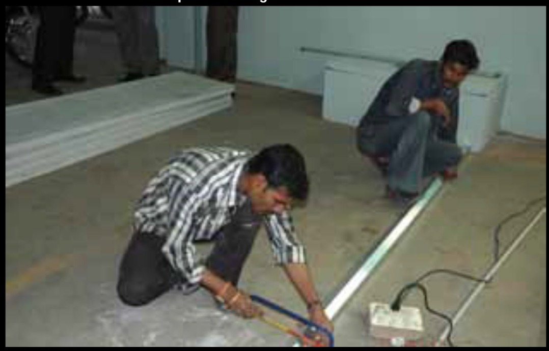
Step 2: Fixing Of Floor Channel